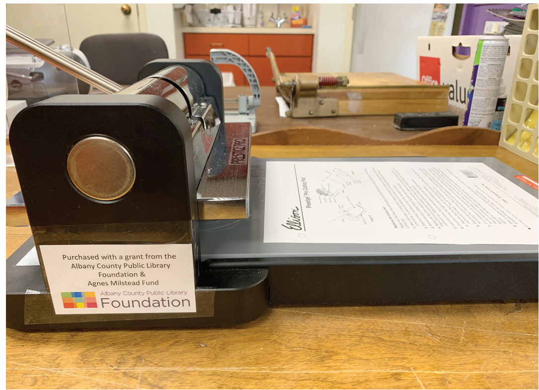
The youth services new die cut machine

The library die cut machine sees weekly use. The Youth Services Department regularly uses the machine to make nametags for weekly storytimes. The different shapes and colors offer a great learning ex-