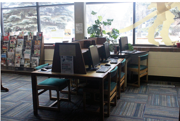
BEFORE: Young Adult furniture.