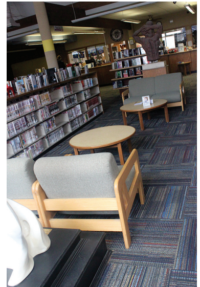
BEFORE: Young Adult furniture.