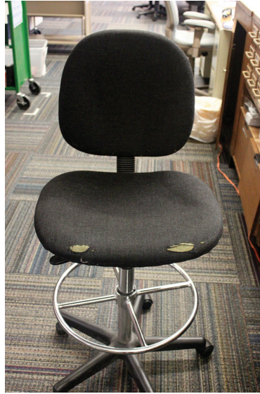
BEFORE: Circulation office chairs.