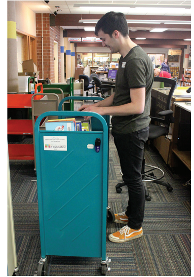
AFTER: Front desk staff show off the new office chairs and book cart.