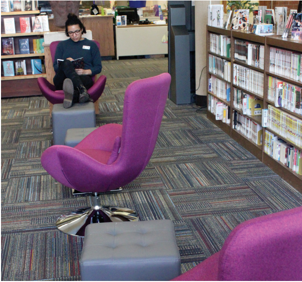
AFTER: Young Adult furniture.