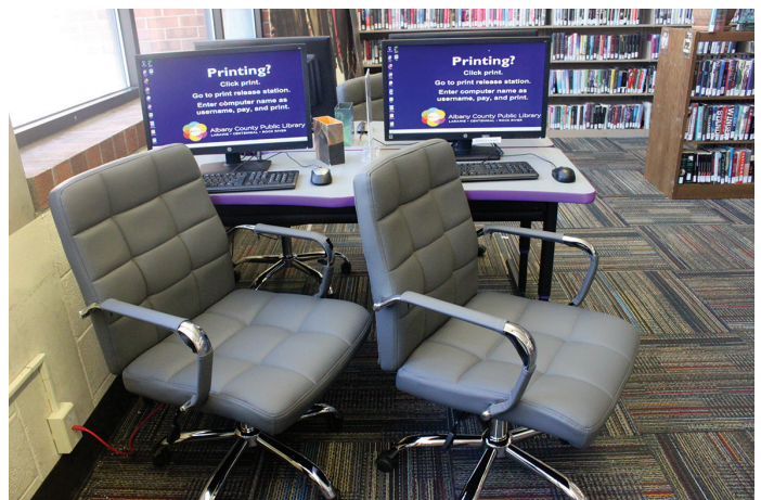
AFTER: Young Adult furniture.