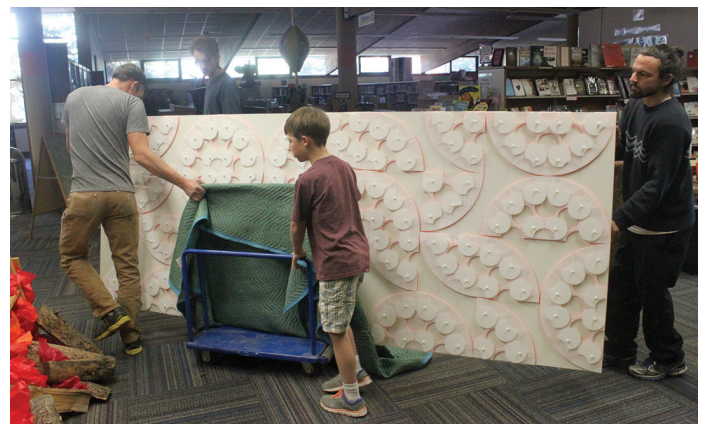
A small crew installs "Do You See What I See?" in the library's adult non-fiction area.