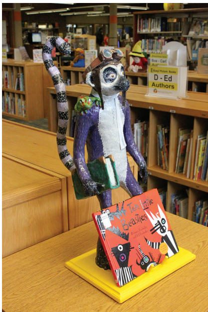
The stars of "A Lemur's Tale" were also created in to a book display by the artist.