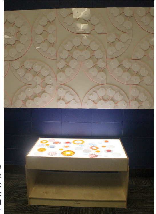
Diana Baumbach's mural "Do You See What I See?"